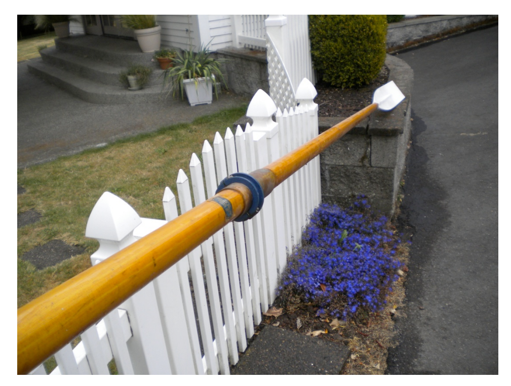
Finally, we have 1 "tulip" style sweep oar. 145". Make an offer and its yours!