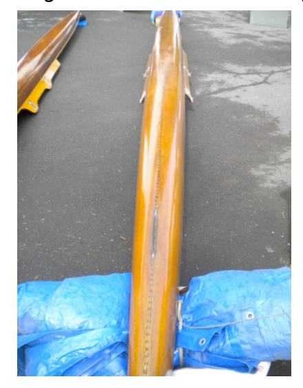
Above: underside of the Sims.